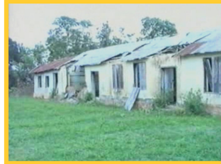
Imagine this is your child's school?