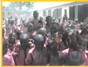
Faces of the children who need your help?