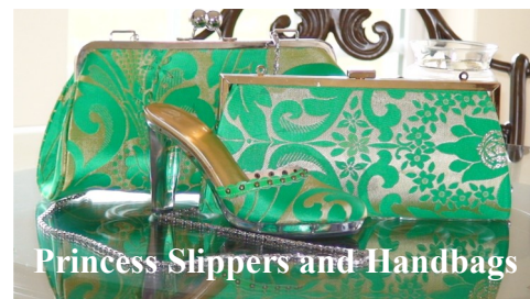
Princess Slippers and Handbags