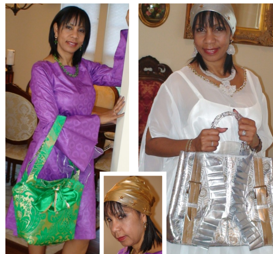
Holiday Totes and Caps