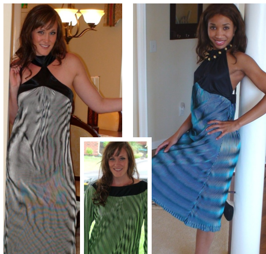
The Stretchy Dress