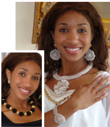
Princess Heirloom Jewelry Collection