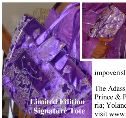
Limited Edition Signature Tote